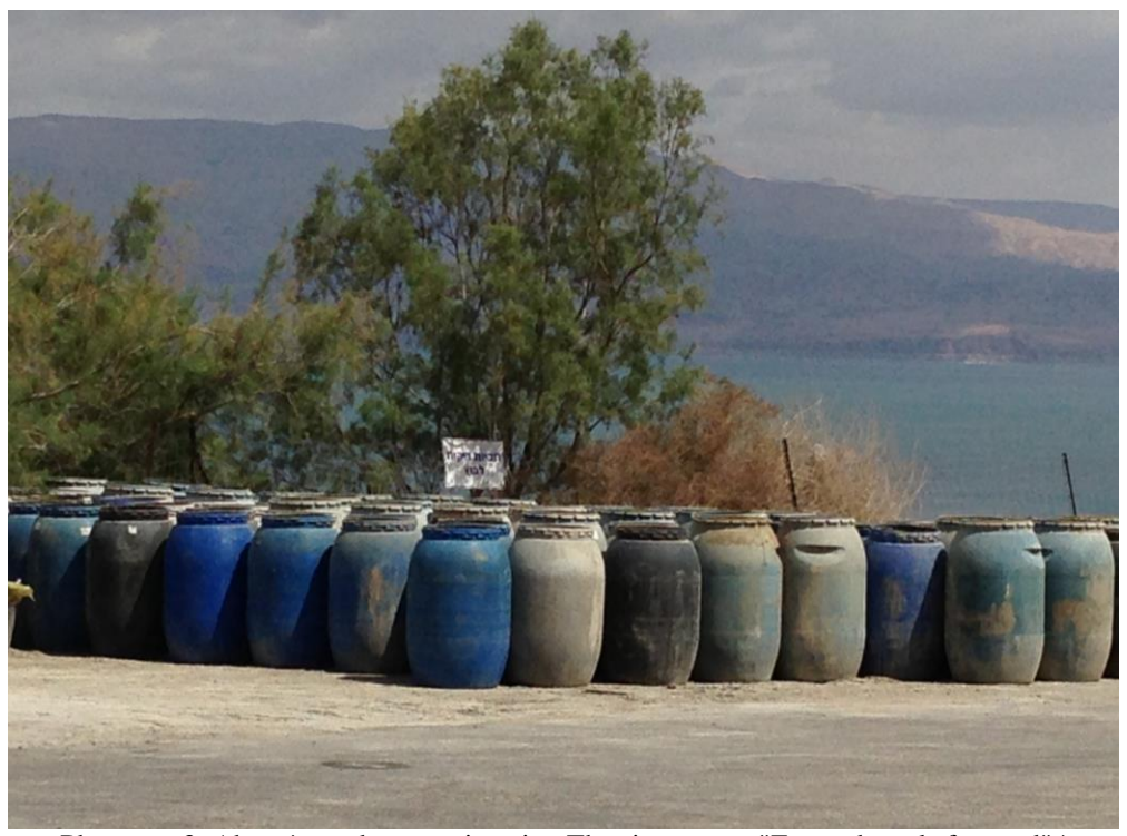
Photo no. 3: Ahava's mud excavation site. The sign states: "Empty barrels for mud" | Miztpe Shalem settlement | Who Profits | April 2013