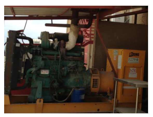
Photo no. 12: SDMO generator, provides by Shmerling-Synchro Energy Engineering in Ahava's production site | Mitzpe Shalem settlement | Who Profits | April 2013

operates five representative offices in Johannesburg, Algiers, Dubai, Cairo and Moscow, and four storage platforms in Miami, Le Havre, Lomé and Dubai.