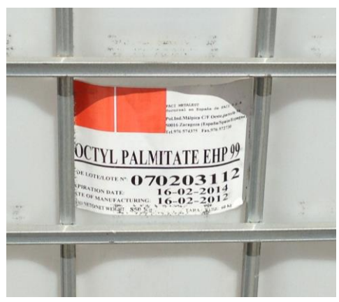
Photo no. 4: Octyl Palmitate supplied to Ahava by Faci Metalest | Miztpe Shalem settlement | Who Profits | April 2013

The company supplies Ahava with Octyl Palmitate (Ethylhexyl palmitate), a fatty acid commonly used in cosmetic formulations as a solvent, carrying agent, pigment wetting agent, fragrance fixative and emollient (Photo no. 4).