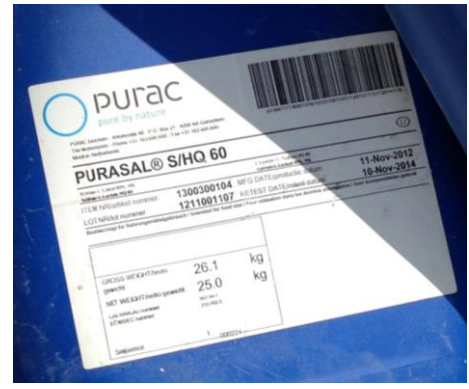
Photo no. 7: Purasal, supplied to Ahava by Purac | Miztpe Shalem settlement | April 2013

The company was founded in the Netherlands and currently operates production units and offices in Brazil, China, France, Japan, Korea, Mexico, USA, Poland, Russia, Singapore, Spain, Thailand and India.