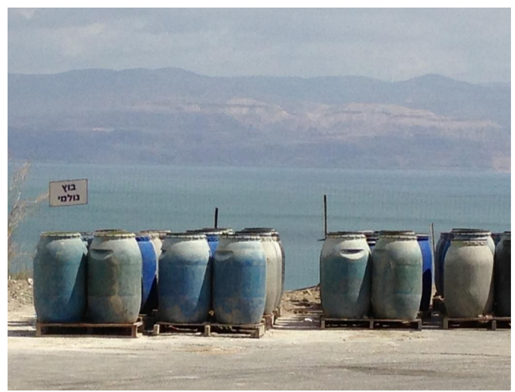
Photo no. 2: Ahava's mud excavation site. The sign states: "Raw Mud" | Miztpe Shalem settlement | Who Profits | April 2013