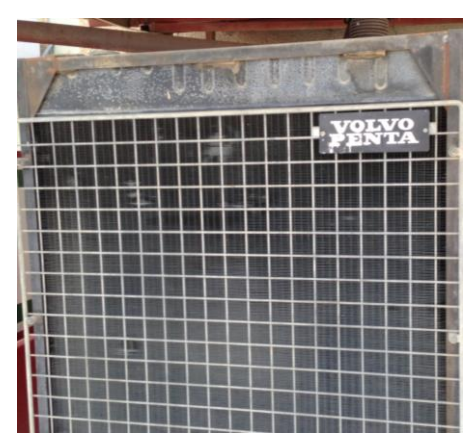
Photo no. 13: Volvo Pentas' engine in Ahava's production site | Mitzpe Shalem settlement | Who Profits | April 2013

Volvo Penta, part of the Volvo group, is a world-leading supplier of engines and complete power systems for marine and industrial applications. The company provides engines to the Ahava factory and visitors center in the settlement of Mitzpe Shalem.