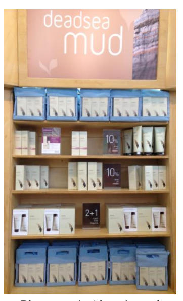
Photo no. 1: Ahava's mud products | Ahava's visitors center, Mitzpe Shelem settlement | Who Profits | April 2013

In a research tour conducted by Who Profits in April 2013, we spotted Ahava's mud, excavated from occupied territories, stored in the company's production site in Mizpe Shalem settlement, as presented in photo no. 2. Photo no.3 presents empty barrels for mud excavation.